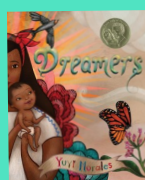
Dreamers by Yuyi Morales

Visit KCLonebook.org to discover One Book titles in all genres and for all ages!