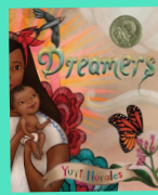
Dreamers by Yuyi Morales

Visit KCLonebook.org to discover One Book titles in all genres and for all ages!