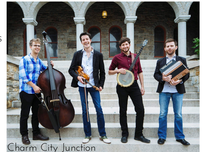
Charm City Junction

Though the series as we know it today launched in 1999, live music has been a library staple since the 1970s. It wasn't until a visiting musical act, Eddie from Ohio, coined the phrase "Dewey Decibel" (a pun on the well-known library classification system, Dewey Decimal) that the series was rebranded with the name we all know and love today.